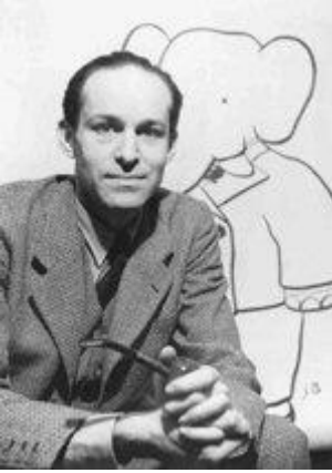
Jean de Brunhoff